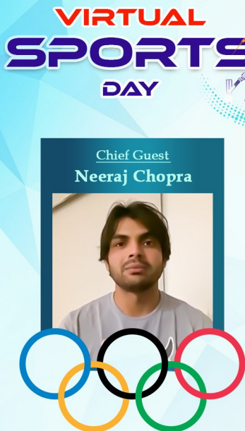
Chief Guest Neeraj Chopra